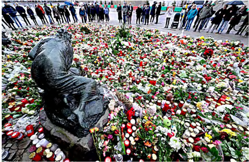
MARKET CAR ATTACK. Flowers and candles have been placed in tribute to the victims outside the Johanniskirche (Johannes Church) at a makeshift memorial near the site of a car-ramming attack on a Christmas market in Magdeburg, eastern Germany, in this file photo taken on Dec. 22, 2024. A verdict for a Saudi psychiatrist who drove a car through a crowded Christmas market in the German city of Magdeburg in 2024, killing six and injuring more than 300, is expected shortly.