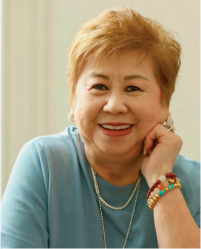
Mary G. Ng

in elevating the country's participation on the global stage. ISF, an affiliated organization of the International Olympic Committee, currently counts 124 member countries, including the Philippines. Its mission centers on promoting education through sport and fostering global youth engagement.