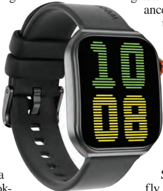
Weofly Edge 2

AS wearable technology becomes increasingly mainstream, consumers are looking for smartwatches that offer meaningful fitness and wellness features without stretching their budgets. Leading the lineup are the Weofly Edge 2, Curve 2, and Vive 2 smartwatches, each designed to deliver essential health monitoring, sports tracking, and smart lifestyle features at accessible price points. Whether users are starting their fitness journey, upgrading from a basic fitness band, or looking for a rugged companion for outdoor adventures, Weofly offers options tailored to different lifestyles and needs. Weofly Edge 2: Premium Style Meets Everyday Fitness Designed for users who want premium aesthetics without compromising functionality, the Weofly Edge 2 combines a sleek design with practical fitness and wellness tools. The smartwatch features a large 1.85-