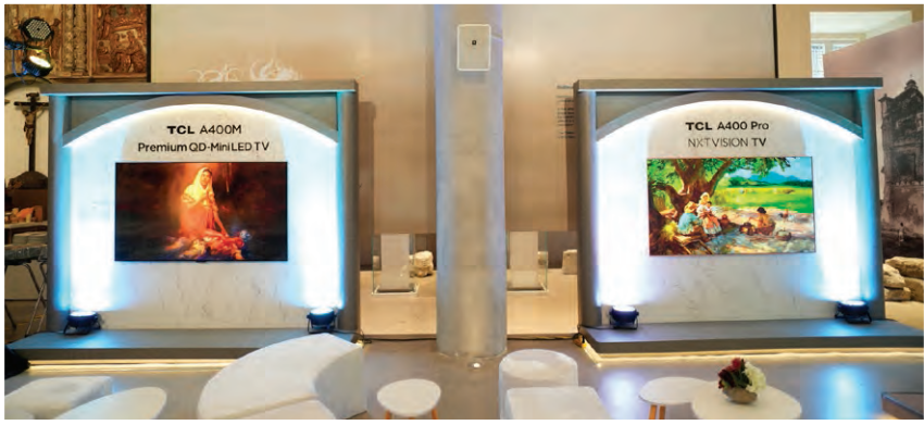
Amorsolo’s Bataan on TCL A400M and Noonday Meal on TCL A400 Pro

age, graced the advanced screens of the TCL A400 Series TVs stationed throughout the venue. Among the featured works are Carabao Riding in Sunset, a peaceful depiction of rural life at day’s end, and Noonday Meal, which captures farmers sharing a well-deserved break during the harvest. The collection also includes Tinikling, a vibrant portrayal of the beloved traditional dance that embodies the joyful spirit of community, alongside Dalagang Bukid, a timeless celebration of the Filipina and the serene beauty of the countryside.