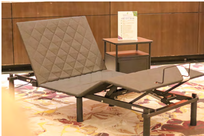
Smart bed frames point to growing demand for home products that combine comfort, function, and easier delivery