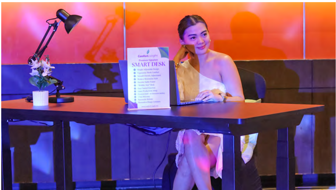
Online furniture shopping continues to reshape how Filipino buyers choose mattresses, sleep accessories, and smart home pieces

"We saw an opportunity to redefine mattress shopping by moving it entirely online, offering a seamless, transparent, and convenient experience