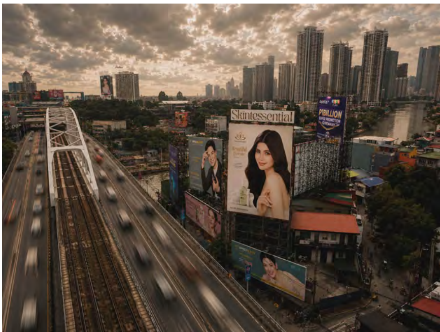
The local beauty brand marks its first year with a Metro Manila billboard campaign focused on skincare, confidence, and daily self-care

This combination of technology and human assistance may explain why online retail continues to expand across categories once considered difficult to digitize.