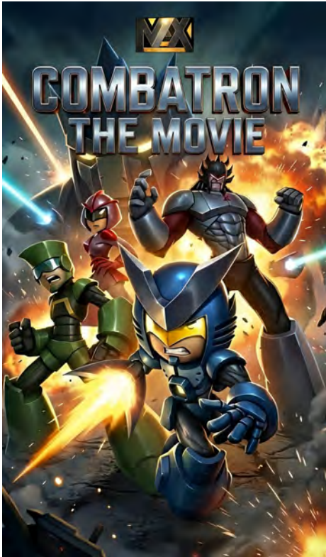
'Combatron' returns as MAVX Productions develops an animated adaptation aimed at longtime readers and a new generation of Filipino viewers

countries, underscoring how emotionally resonant stories can connect with viewers across borders. With Combatron , MAVX appears to be banking on that same connection, drawing in audiences who followed the comic in its early years while widening the character's reach to younger viewers. Details about the cast and release date have yet to be announced. Still, the