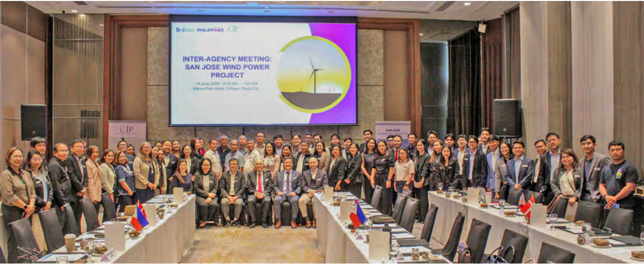
The Board of Investments convenes an inter-agency meeting to fast-track permits for the 300-megawatt San Jose Wind Power Project, a renewable energy investment backed by Copenhagen Infrastructure Partners in Nueva Ecija province.

The Philippine Statistics Authority based the report on its annual Consolidated Accounts and Income and Outlay Accounts.