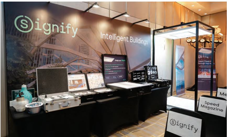
Signify products on display

Circularity as a Strategic Business Imperative The event centered on Signify’s circularity framework, Use Less, Use Longer, Use Again, which serves as the foundation of the company’s approach to sustainable innovation. Through this framework, Signify demonstrated how businesses can move beyond conventional sustainability initiatives and embed circularity into every stage of the value chain from product design and manufacturing to installation, maintenance, upgrades, and end-of-life management. Attendees explored the latest global sustainability trends, including the increasing adoption of Science-Based Targets (SBTi), the growing focus on Scope 3 emissions reporting, and the rising demand for solutions that deliver both environmental and economic benefits. While sustainability commitments continue to increase worldwide, studies show that global circularity rates remain low, highlighting the need for businesses to transform ambition