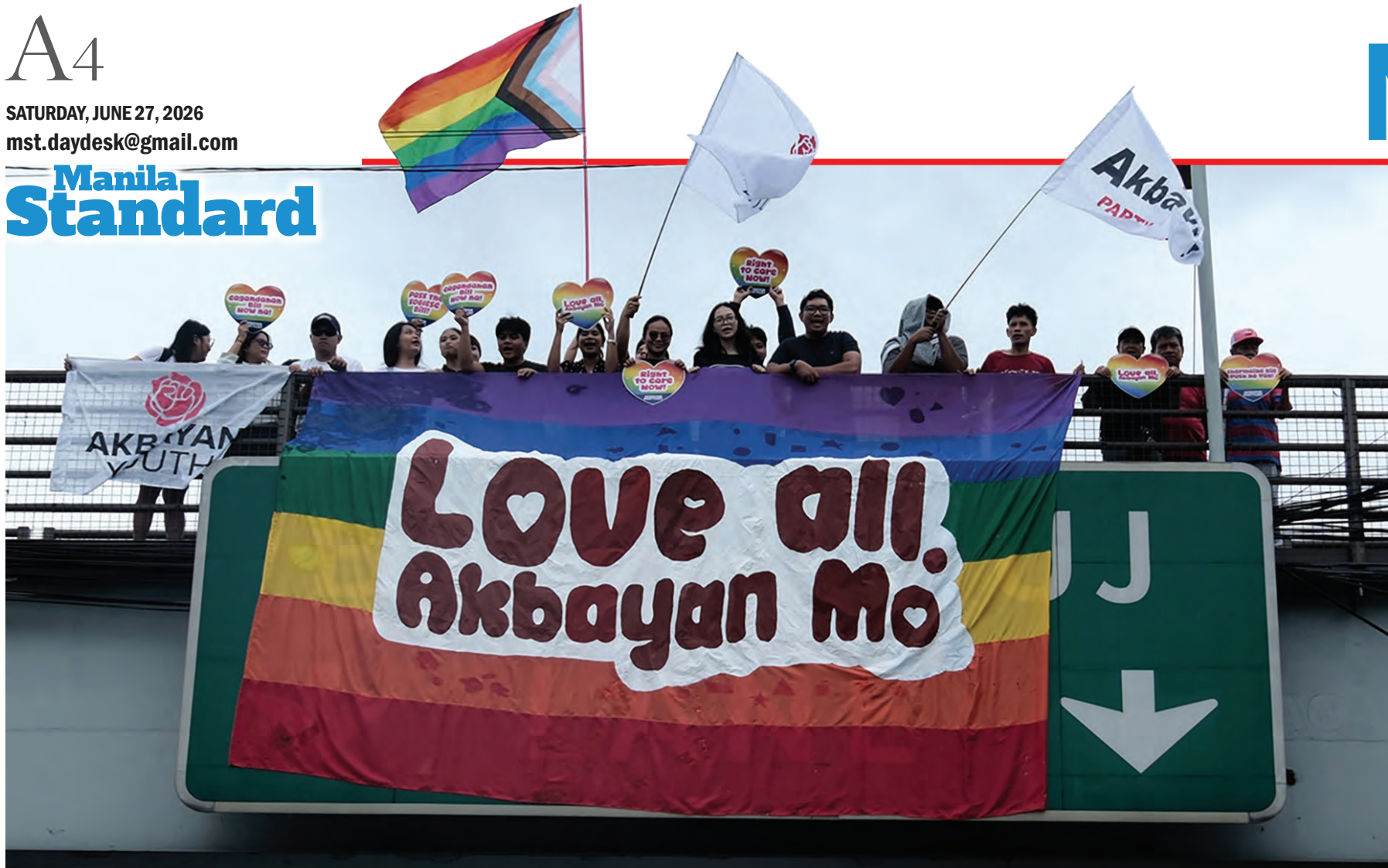
RAINBOW BANNER. A day before the annual Pride March today, Akbayan Party and its youth members unfurl a giant rainbow pride banner with the slogan ‘Love All’ at the Philcoa footbridge along Commonwealth Ave. on Friday, June 26, 2026. in Quezon City.