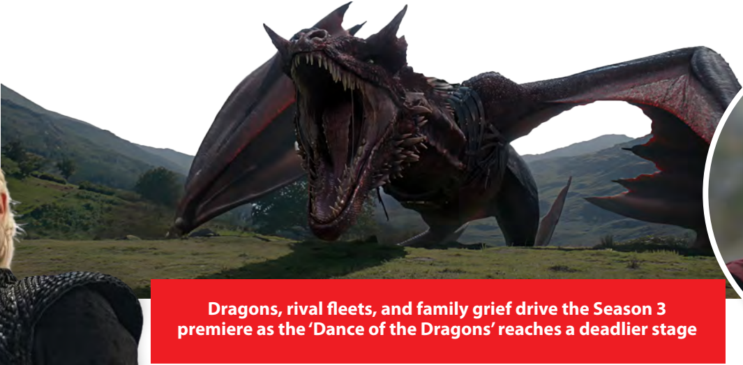
Dragons, rival fleets, and family grief drive the Season 3 premiere as the 'Dance of the Dragons' reaches a deadlier stage

HBO Max Philippines invited members of the press, content creators, celebrities, and fans of the series for an exclusive screening of the first episode of the third season. The HBO Max series returns with dragons in the sky, ships burning at sea, and a death that makes the war feel personal right away. In its first episode, the fight for the Iron Throne is no longer just about power. It is about a family breaking apart. Based on George R.R. Martin's Fire & Blood , House of the Dragon takes place nearly 200 years before the events of Game of Thrones . The series follows the Targaryens, a ruling family whose internal struggle over succession has erupted into a civil war known as the Dance of the Dragons. Season 3 wastes little time showing the consequences of that conflict. The premiere centers on the Battle of the Gullet, a large-scale clash that brings dragons, fleets, and rival forces into direct confrontation. For viewers who have spent years following the series, the battle delivers one of the story's most anticipated moments. For newer viewers, it offers a quick understanding of what is at stake. Beneath the spectacle are parents trying to protect their children, heirs trying to prove themselves, Rhaenyra Targaryen faces the cost of a widening civil war as the new season pushes the fight for succession into deadlier territory