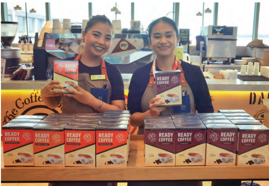
GOOD CUP. Shops at the Clark International Airport sell elegantly packaged coffee products sourced from coffee producing communities across the country.