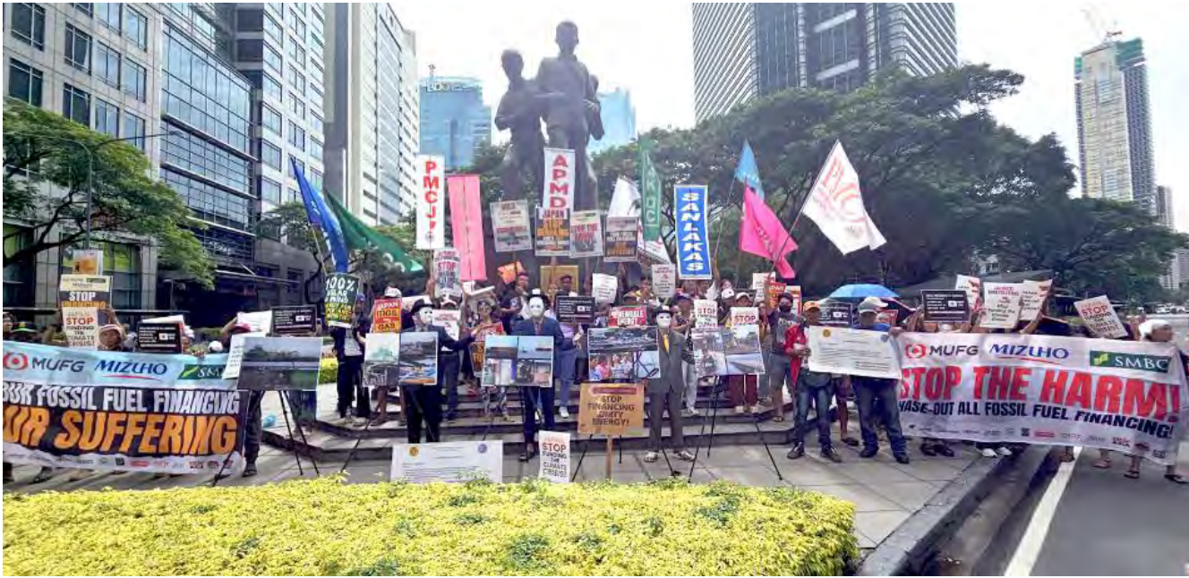
NO TO FOSSIL FUEL. Environmental advocates, labor groups, and militant organizations stage a rally along Ayala Avenue in Makati City to demand cessation of investments in fossil fuel. Led by the Asian Peoples’ Movement on Debt and Development, the protest action coincides with the annual general meetings in Tokyo, Japan of giant financing institutions mostly involved in fossil fuel.

In the Philippines, advocates are targeting these institutions for backing a massive domestic liquefied natural gas (LNG) expansion. The Japanese banks are major financiers of developers behind LNG import terminals and gas power complexes in Batangas—infrastructure that critics say locks the developing nation into decades of expensive, imported fossil fuels, the protest organizers said in a statement.