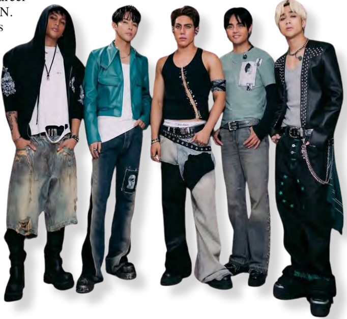
SB19 continues to widen P-pop's reach overseas with a Grammy Museum appearance