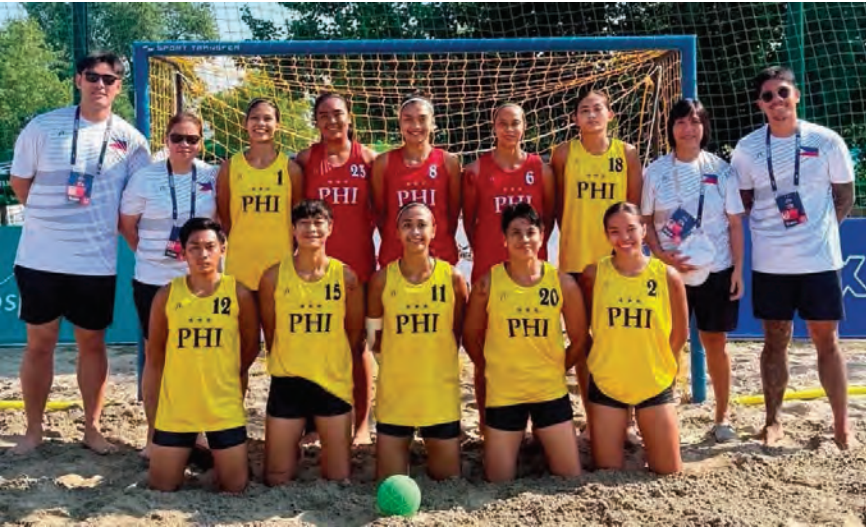
The Philippine women's handball team