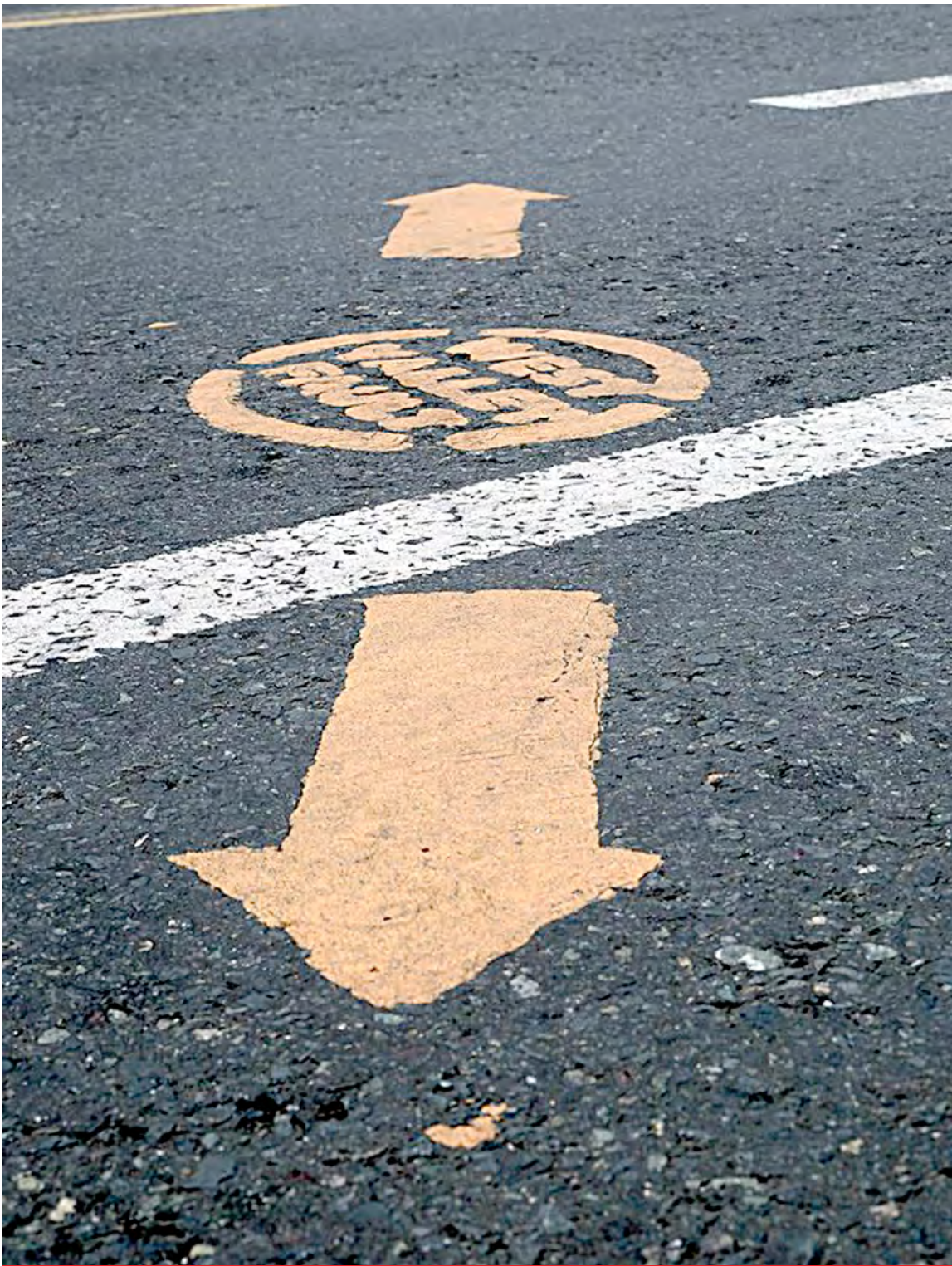
ACTIVE FAULT LINE. This image prepared by the Philippine Institute of Volcanology and Seismology shows the West Valley Fault Line painted on the pavement along A. Bonifacio Avenue in Barangay Barangka, Marikina City to raise public awareness about the potential danger posed by the so-called Big One, a major earthquake that could potentially leave a wide swathe of destruction in Metro Manila.