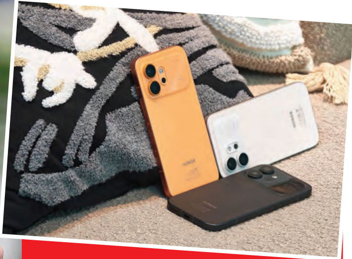
From photography powerhouse to lifestyle companion, HONOR 600 Series proves it’s more than just an AI smartphone

Snapdragon 7 Gen 4 with 27% CPU and 30% GPU gains for powerful gaming and fluid daily performance. The HONOR 600 Pro steps up to the Snapdragon 8 Elite on 3nm process technology, achieving 45% CPU and 44% GPU improvements — true flagship-level responsiveness across demanding applications and multitasking. A comprehensive suite of AI night algorithms enhanced by AI Cloud Enhancement ties the system together: AI Enhanced Night Photography across 0.6–10x zoom, AI Enhanced Night Portrait with multi-form bokeh