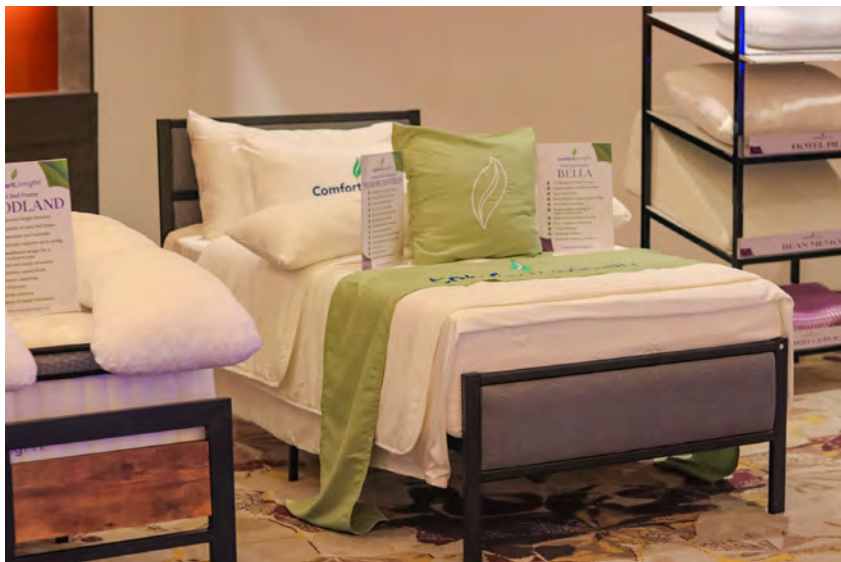
Mattress shopping moves further into e-commerce as Filipino buyers look for convenience and practical sleep solutions