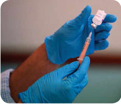
A dose of the AstraZeneca/Oxford Covid-19 vaccine is prepared at a vaccination center.