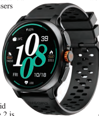
Weofly Vive 2

AMOLED display, a full-metal unibody construction, and durable Asahi high-hardness glass protection, the Curve 2 is designed for everyday wear while delivering the essential smart features modern users expect. The smartwatch supports more than 100 sports modes and offers 24/7 health monitoring capabilities, helping users keep track of their daily wellness goals. Combined with 3ATM water resistance and a comfortable liquid silicone strap, the Curve 2 is built to accompany users from workdays to workouts. Weofly Vive 2: Built for Adventure For outdoor enthusiasts and active individuals, the Weofly Vive 2 is engineered to withstand more demanding environments. Featuring a rugged body with a stainless-steel bezel and buttons, the smartwatch is backed by 13 U.S. MIL-STD-810H certifications and 5ATM water resistance. It is equipped with precise